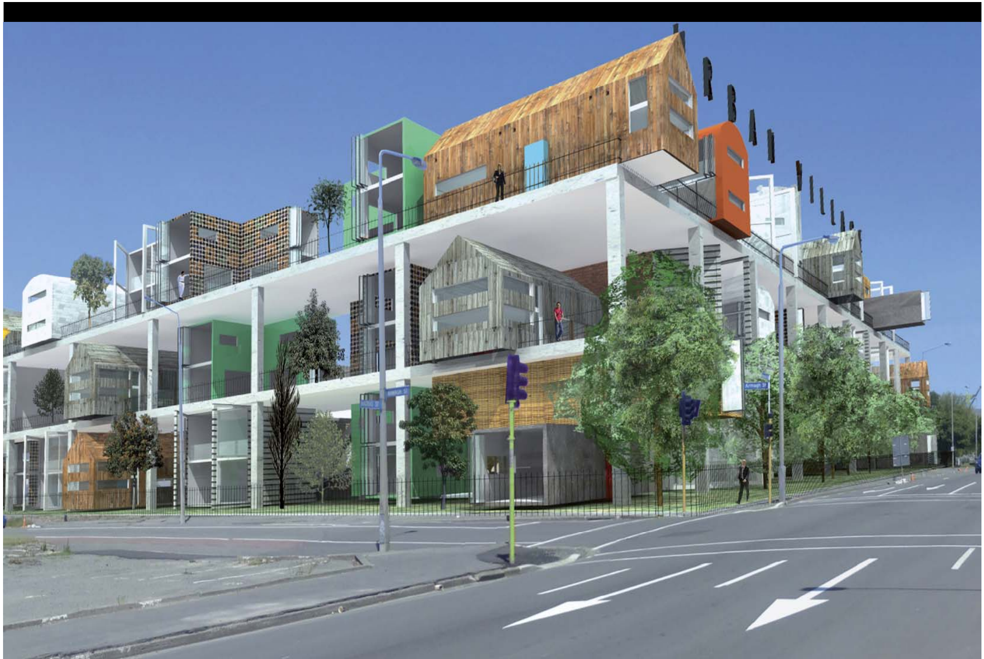
Project drawing from HALLION DESIGN LTD, ALL DESIGN LTD AND INFRATIL INFRASTRUCTURE PROPERTY LTD, NEW ZEALAND AND UNITED KINGDOM