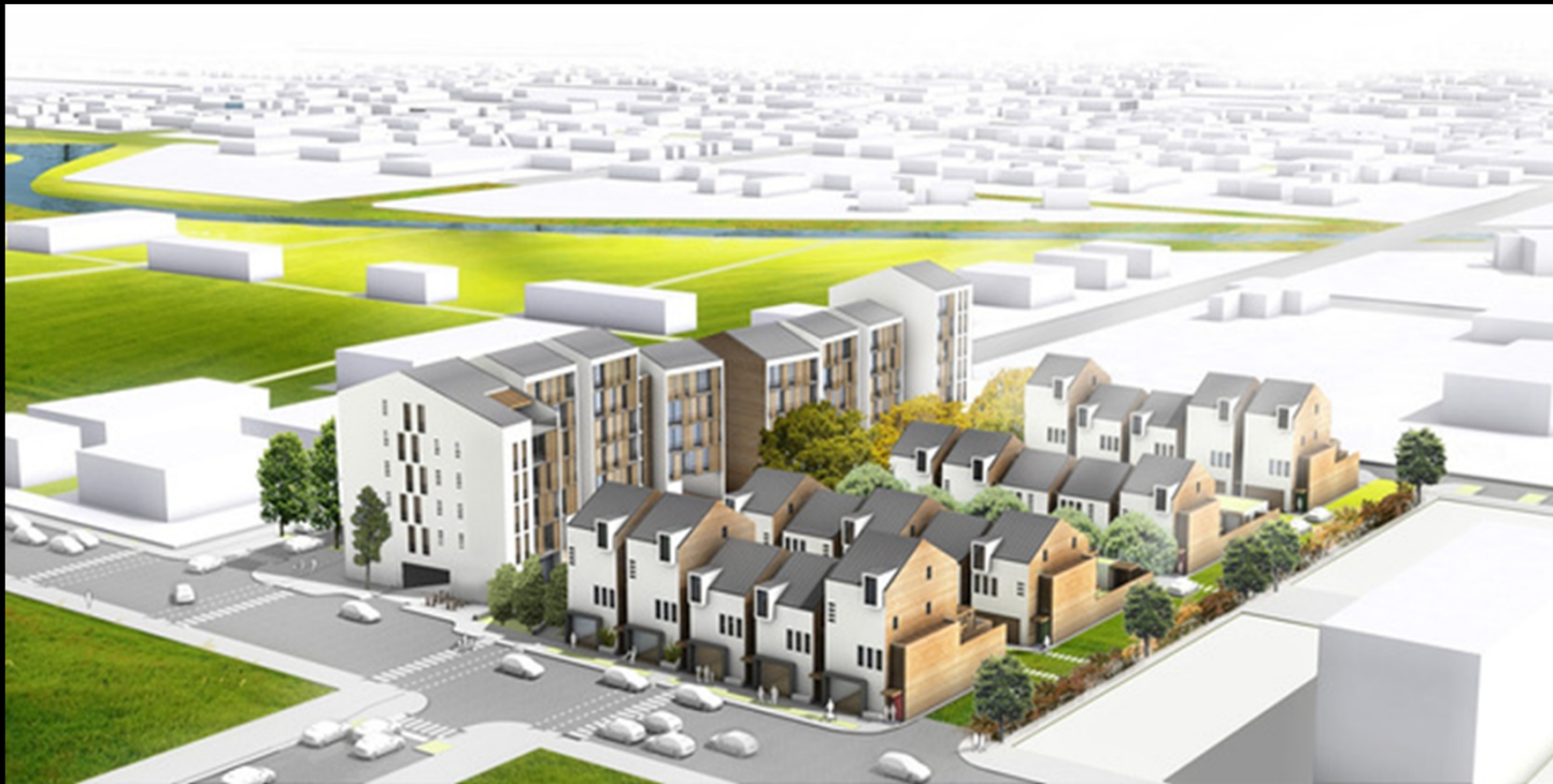
Project drawing from Anselmi Attiani Associated Architects, Holloway Builders. Courtesy of Breathe - The New Urban Village project.