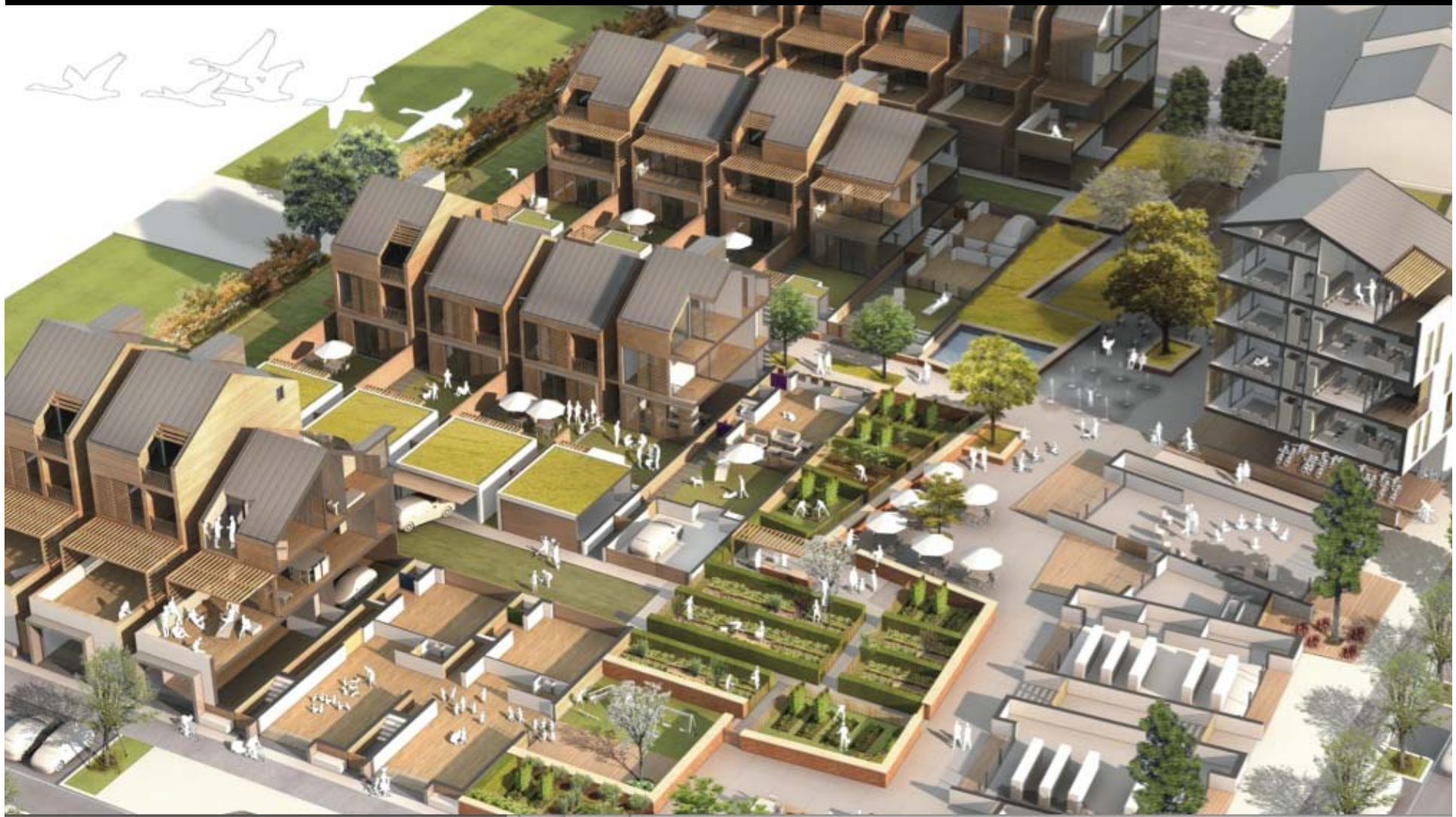
Project drawing from Anselmi Attiani Associated Architects, Holloway Builders.