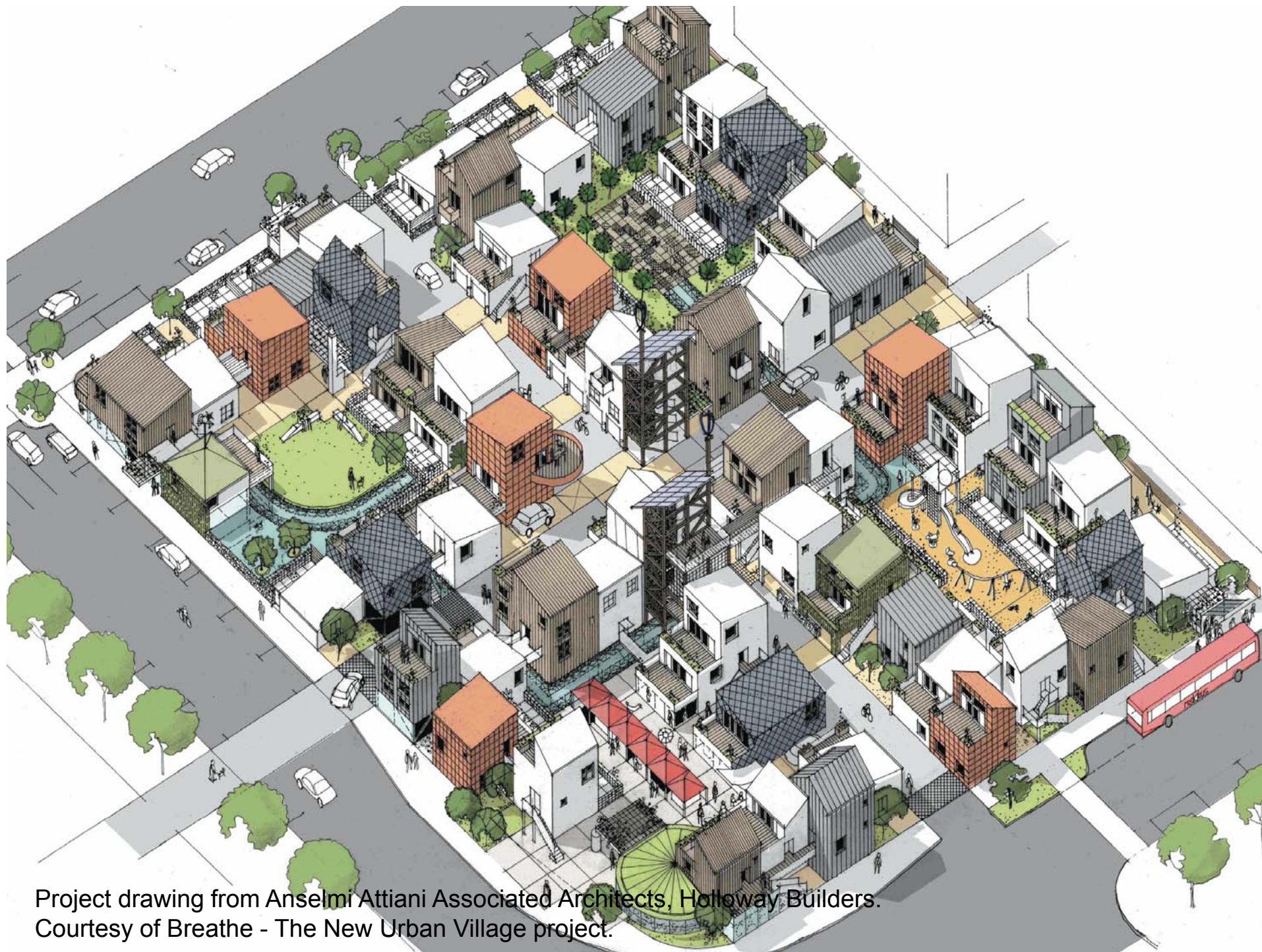
Project drawing from Anselmi Attiani Associated Architects, Holloway Builders. Courtesy of Breathe - The New Urban Village project.