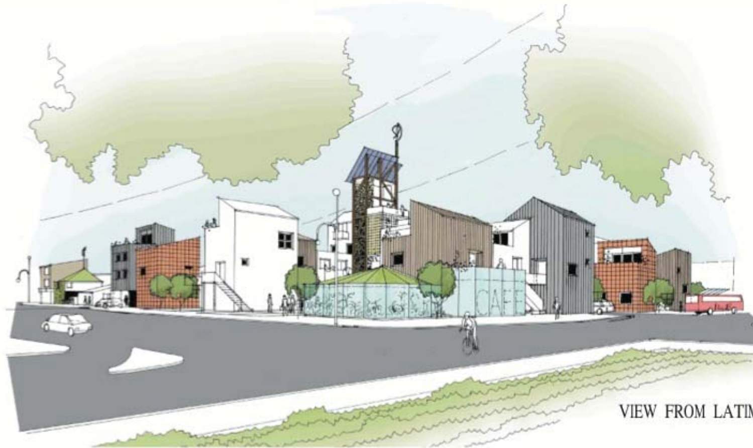
VIEW FROM LATIMER SQUARE

Project drawing from Anselmi Attiani Associated Architects, Holloway Builders.