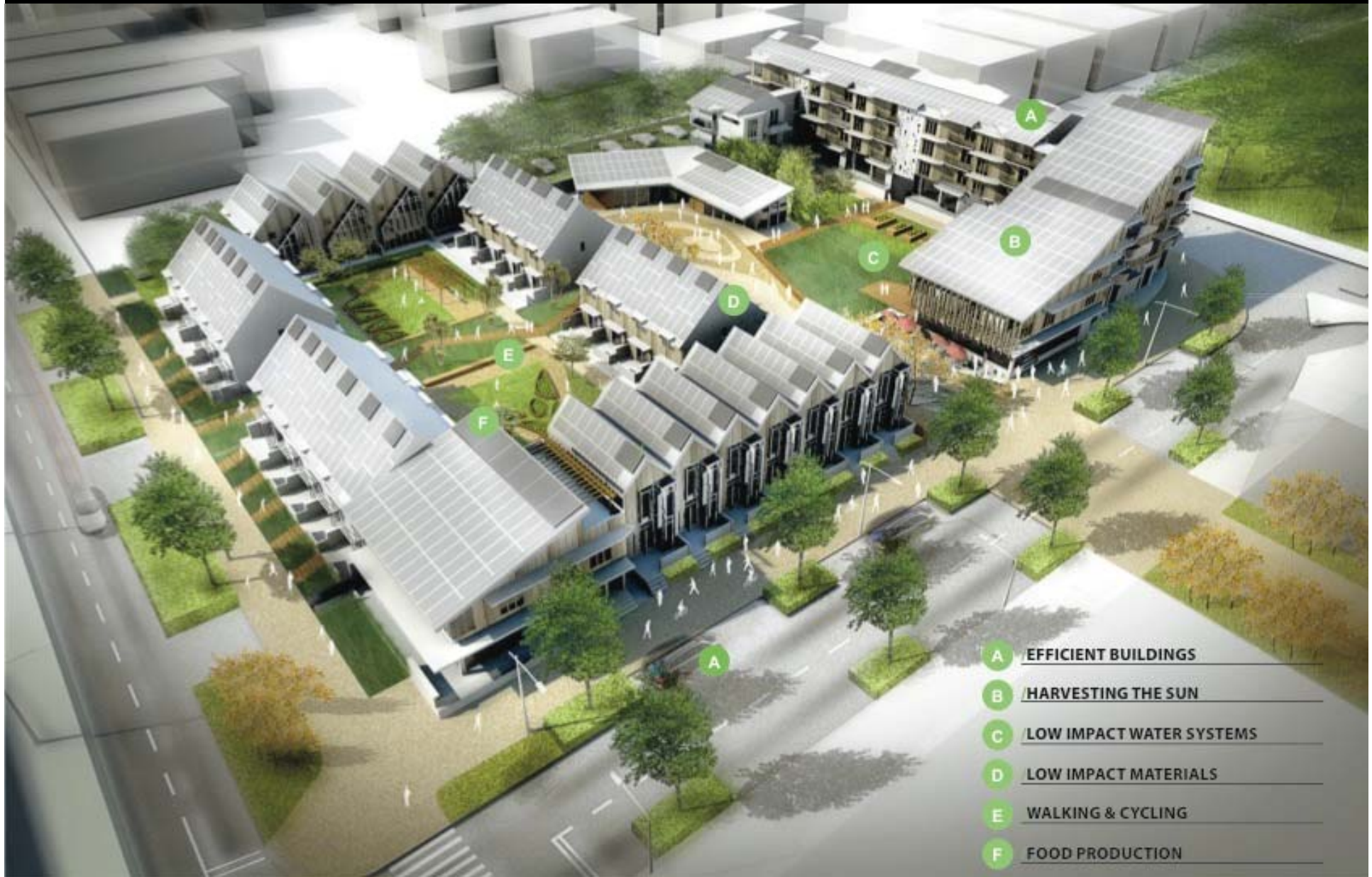
Project drawing from Anselmi Attiani Associated Architects, Holloway Builders.