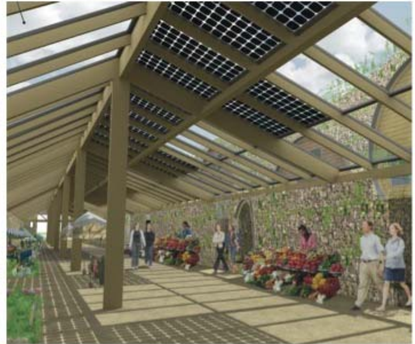
Project drawing from ZEDFACTORY, ZEDPROJECTS, UNITED KINGDOM Courtesy of Breathe - The New Urban Village project.