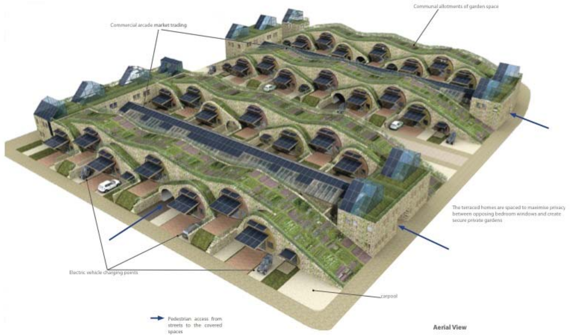
Project drawing from ZEDFACTORY, ZEDPROJECTS, UNITED KINGDOM