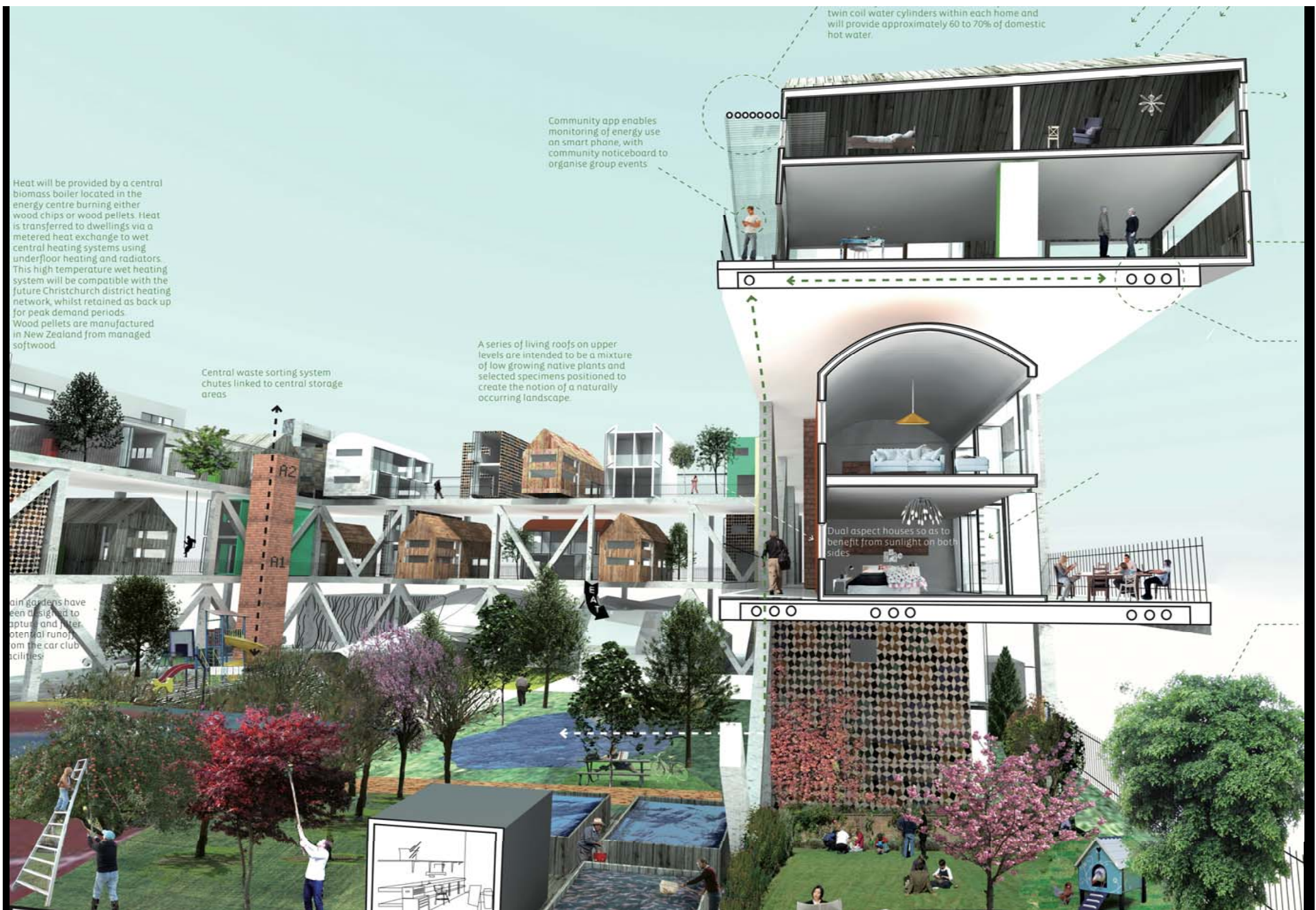
Project drawing from HALLION DESIGN LTD, ALL DESIGN LTD AND INFRATIL INFRASTRUCTURE PROPERTY LTD, NEW ZEALAND AND UNITED KINGDOM